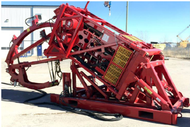
HR-6100 with 100-in. hydraulic short-fold tubing guide on a transport skid with hydraulic tilt frame and stabbing winch